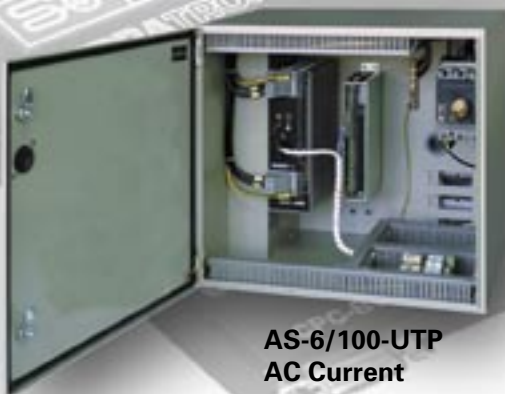
AS-6/100-UTP AC Current