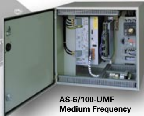
AS-6/100-UMF Medium Frequency